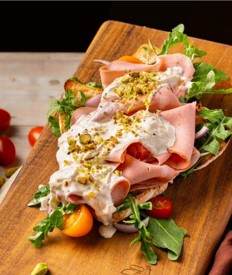
Mortadella e Burrata 320