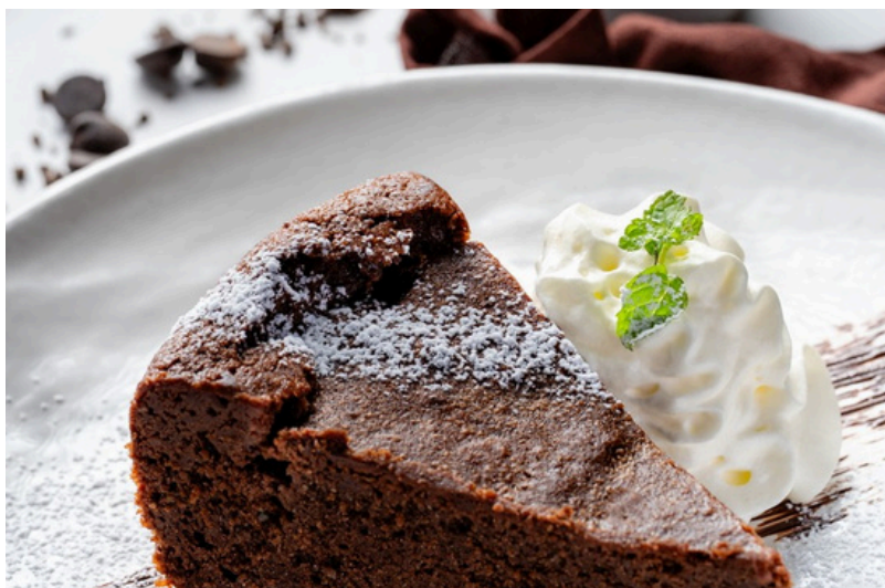
Torta Caprese 190

Italian Style Chocolate Cake with Almond