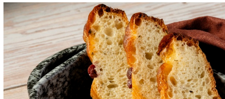
Focaccia + Sauce 3 Slide 90 120