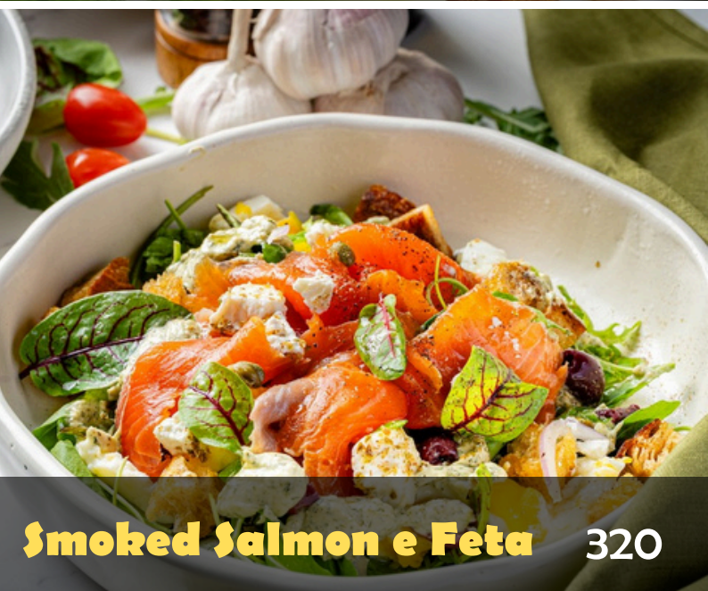
Smoked Salmon e Feta