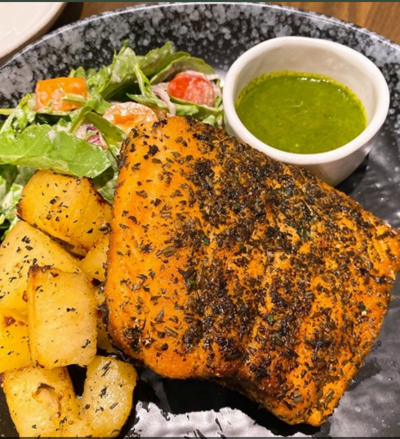
Himalayan Salmon High Grade Salmon Grilled with Herbs 490