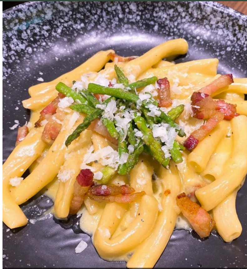
Asparagus Carbonara Classic Carbonara with a twist of Fresh Asparagus 390