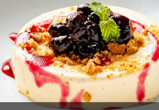
Panna Cotta 190