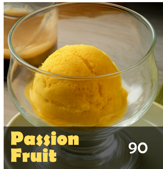
Passion Fruit 90