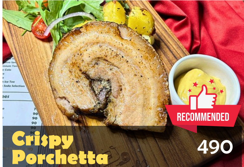
Crispy Porchetta 490