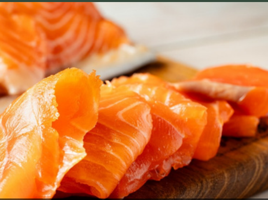
Smoked Salmon 60g 150