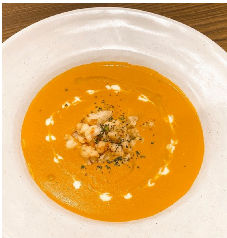
Lobster Bisque Creamy Rock Lobster Bisque 390