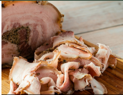
Porchetta 60g 120