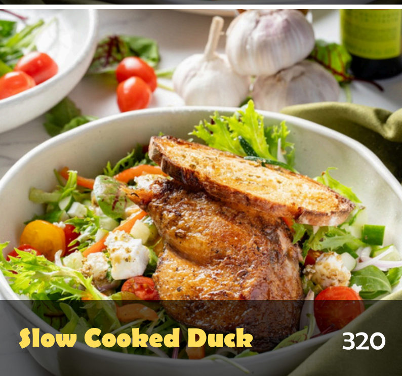
Slow Cooked Duck