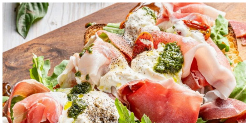
Parma Ham e Burrata 360