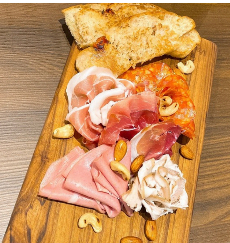
Mixed Cold Cuts Parma Ham, Speck, Mortadella, Spicy Salami and Porchetta 490