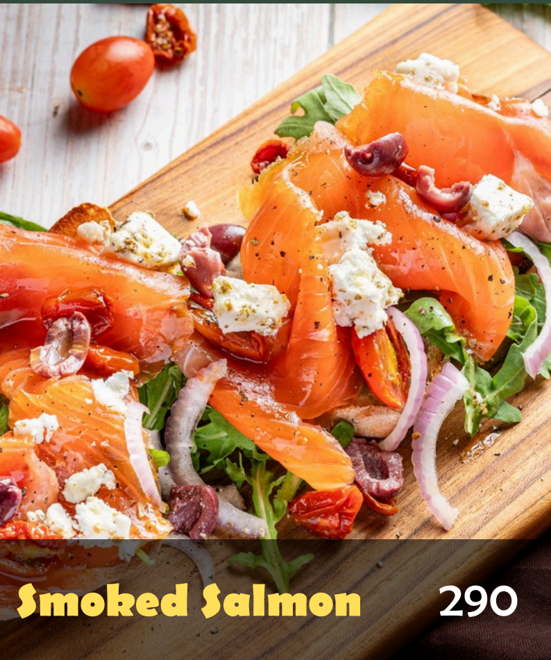
Smoked Salmon 290