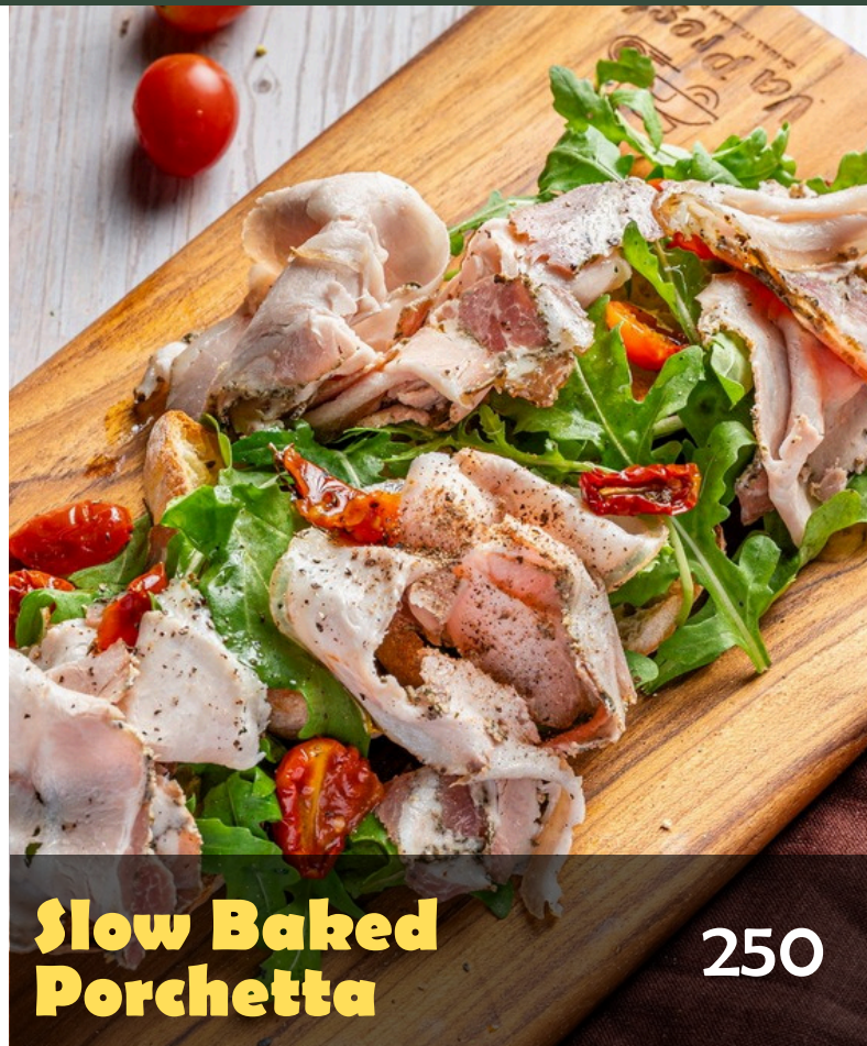
Slow Baked Porchetta 250