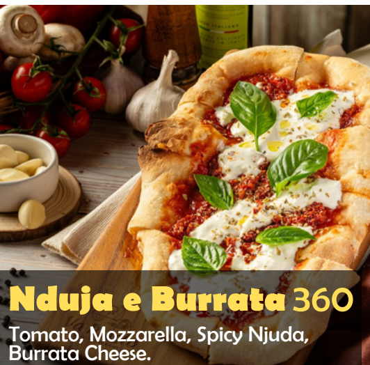
Nduja e Burrata 360

Tomato, Mozzarella, Mushrooms, Fresh truffle Slices, Burrata Cheese.