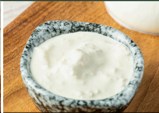
Stracciatella Burrata 60g 90