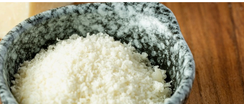
Parmesan cheese 30ml 120