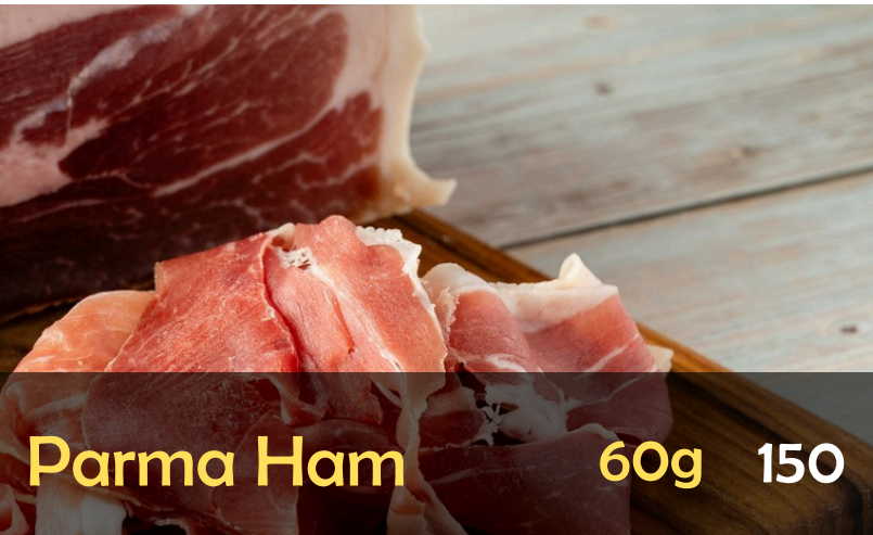
Parma Ham 60g 150