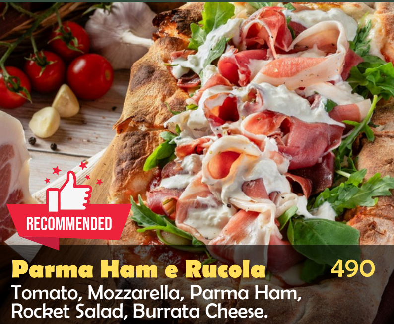
Parma Ham e Rucola 490

Tomato, Mozzarella, Parma Ham, Rocket Salad, Burrata Cheese.